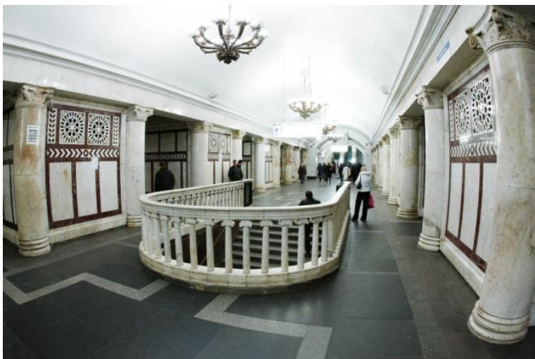
[passage from the green metro line to the brown (radial) line]

At the Paveletsky rail terminal, follow the M sign to find the metro station. Information on tickets and fares can be found here . Take the escalator down to the Павелецкая ( Paveletskaya ) metro station on the green М Замоскворецкая metro line, and then take the stairs in the middle of the platform hall down to the passage to the Paveletskaya station on the brown М Кольцевая (radial) line.