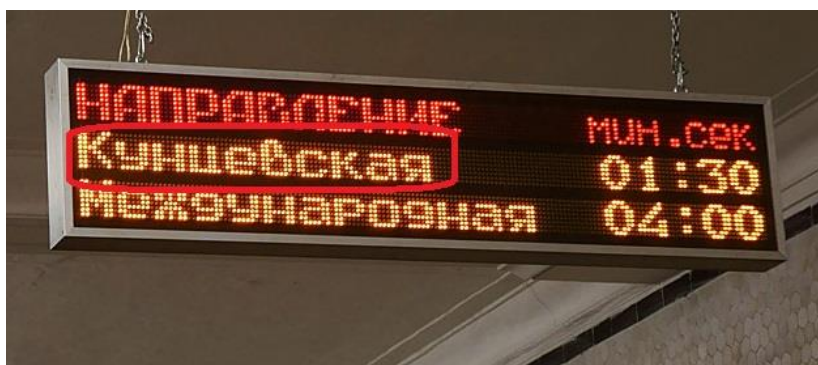
[the board showing the estimated time left till the train's arrival]

Be careful , there are two directions the trains take from that platform – towards the Кунцевская ( Kuntsevskaya ) station and towards the Международная ( Mezhdunarodnaya ) station. An electronic board specifies the estimated time (min.sec) in which the next train is arriving. You need to follow the 'Кунцевская' times on the board.